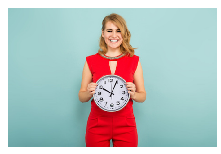
Beginner 1 | Lesson 03 | Basic Verbs