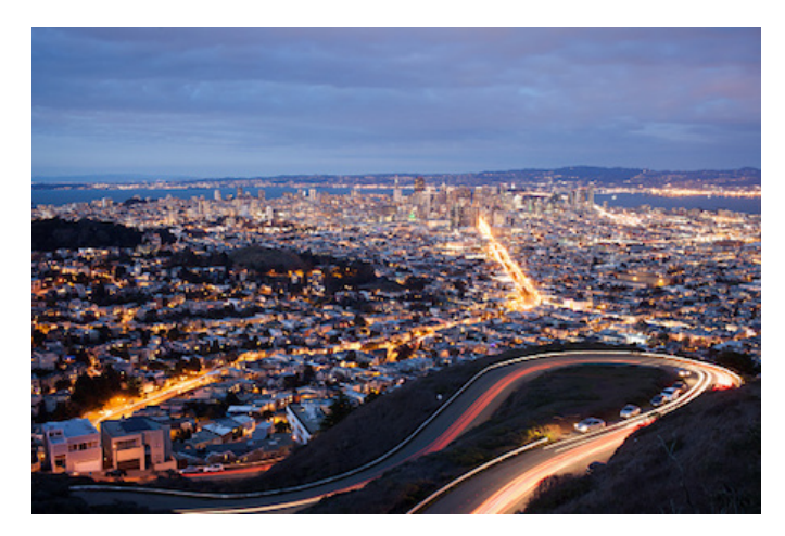
Beginner 1 | Lesson 05 | Adjectives