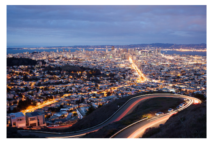
Beginner 1 | Lesson 05 | Adjectives