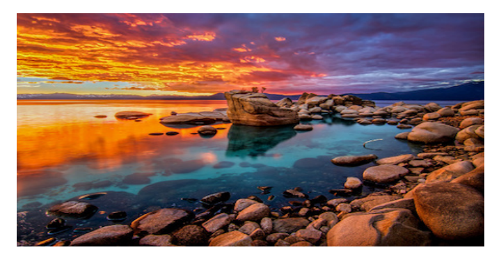
Beginner 1 | Lesson 04 | Subject Verb Agreement