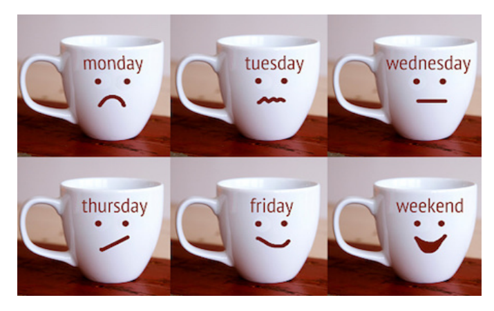
Beginner 1 | Lesson 06 | Days of the Week