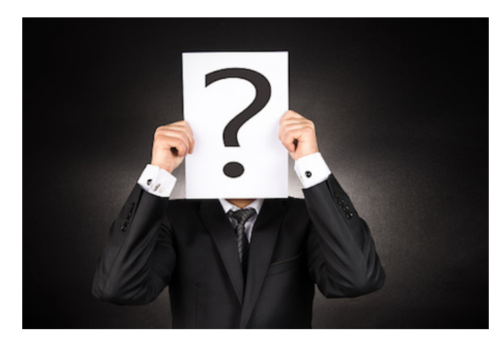
Beginner 1 | Lesson 09 | Subject Pronouns