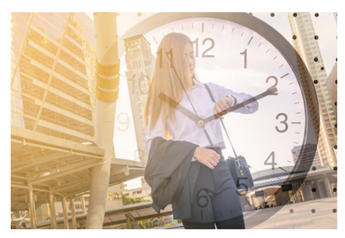
Beginner 1 | Lesson 8 | Basic Sentence Patterns