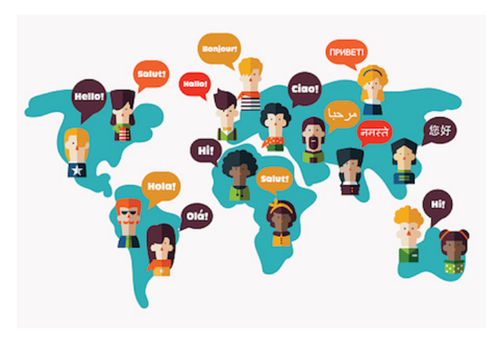
Beginner 1 | Lesson 7 | Nationalities, Languages, Countries