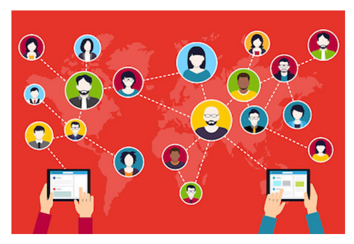
Beginner 1 | Lesson 10 | Object Pronouns