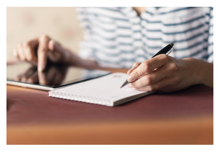
Grammar Talks 4-08 Modals of Obligation