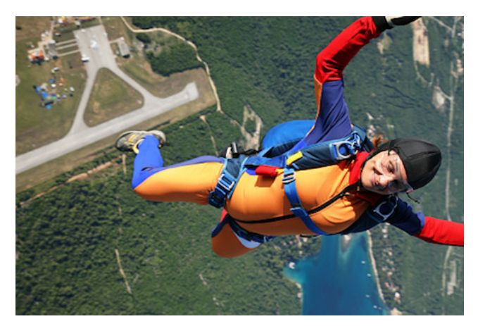
Grammar Talks 4-06 Would like / Want to