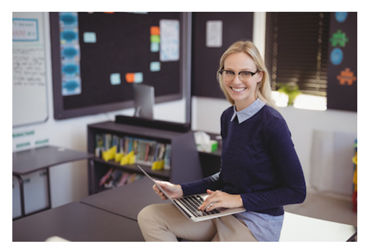
Grammar Talks 4-02 Causative Verbs