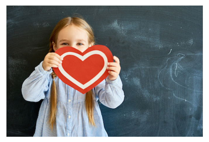
Grammar Talks 4-04 Would for Past Tense