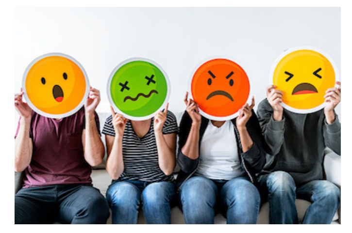
Grammar Talks 4-10 Zero Conditionals