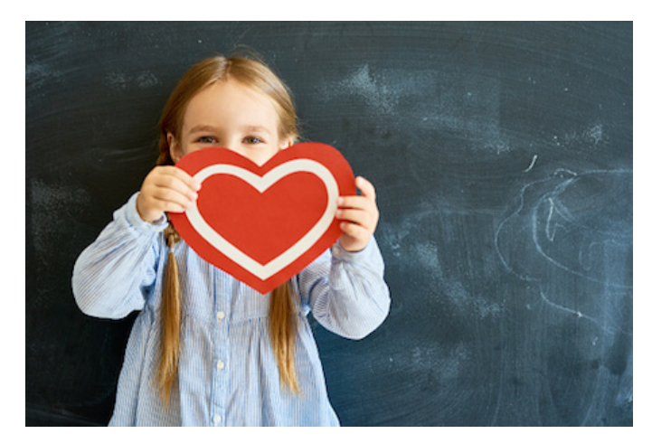
Grammar Talks 4-04 Would for Past Tense